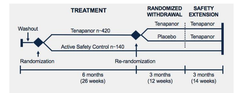
The hyperphosphatemia market

Phosphate binders are the only drugs marketed for the treatment of hyperphosphatemia in ESRD patients. The various types of phosphate binders commercialized in the United States include the following: